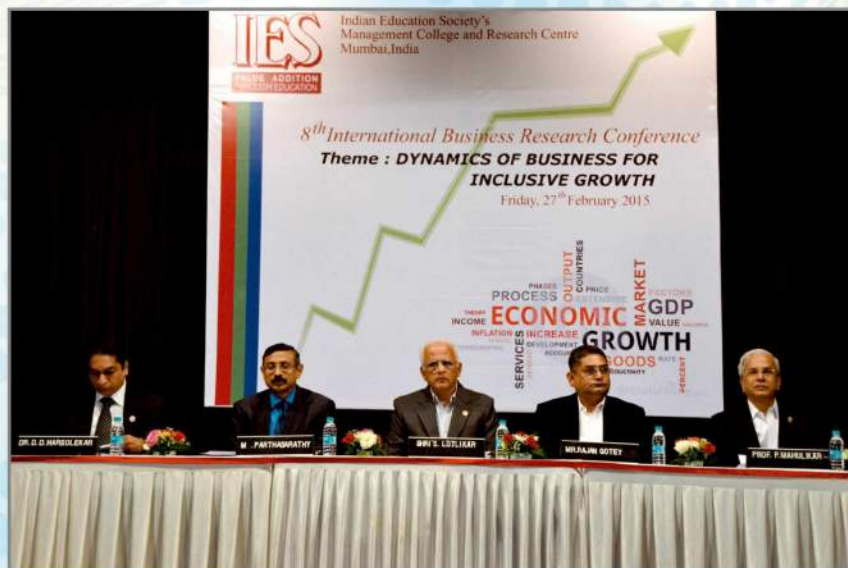
8th International Business Research Conference