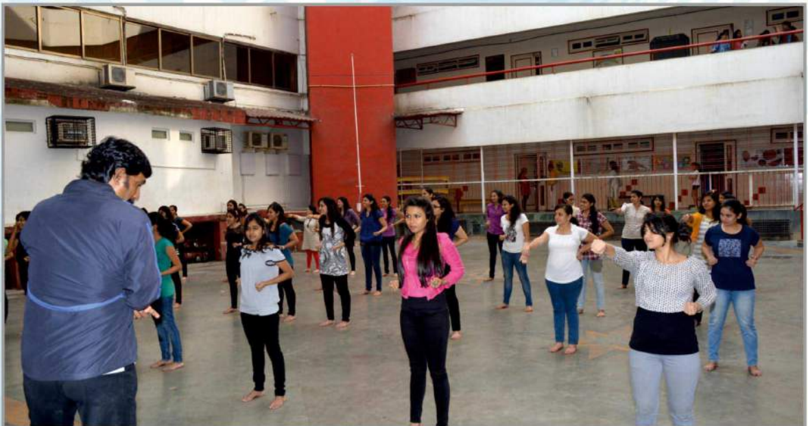
Girls being trained for Self Defence