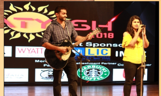
Singing competition, part of the cultural events