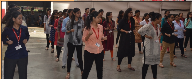
Girl students of IES practising few self defense moves