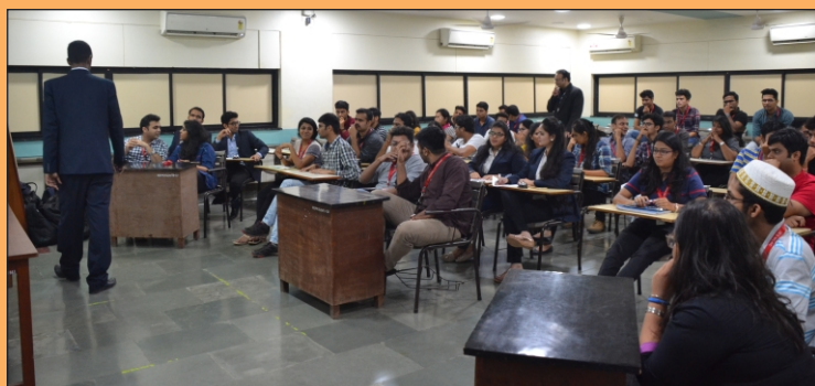
Students actively participating in the quiz