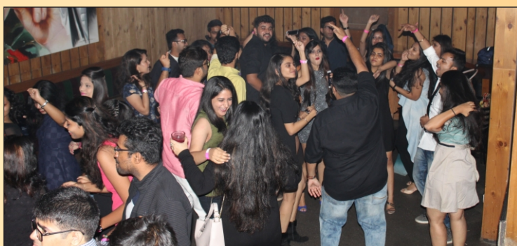
Students groove to the beat of the music