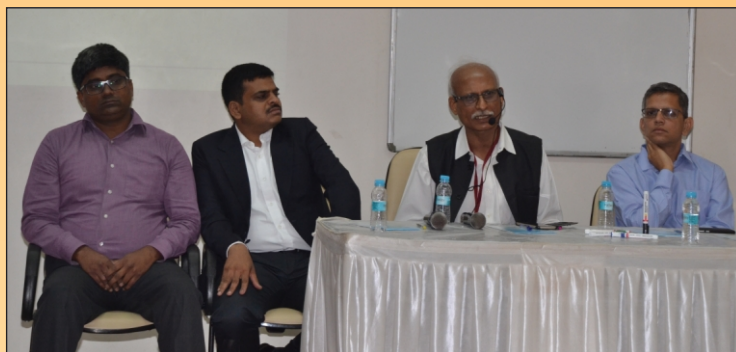
Finance experts at the dais