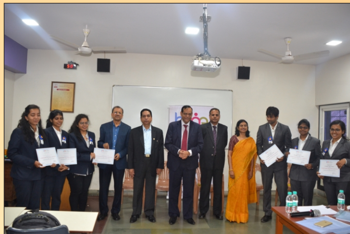
IES runners up team with juries and dignitaries