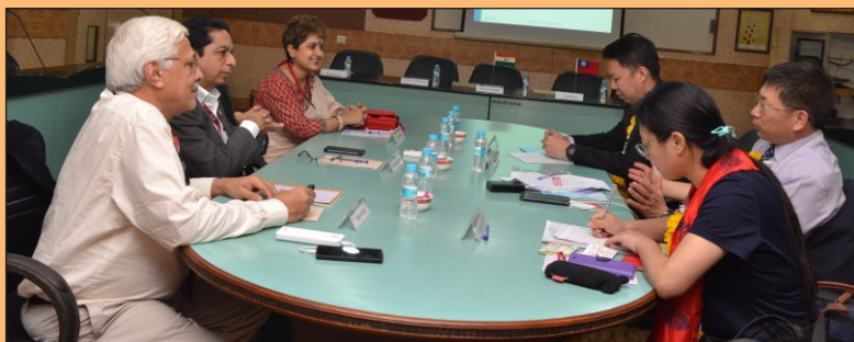
Discussion between representatives of IES MCRC and YUNTECH