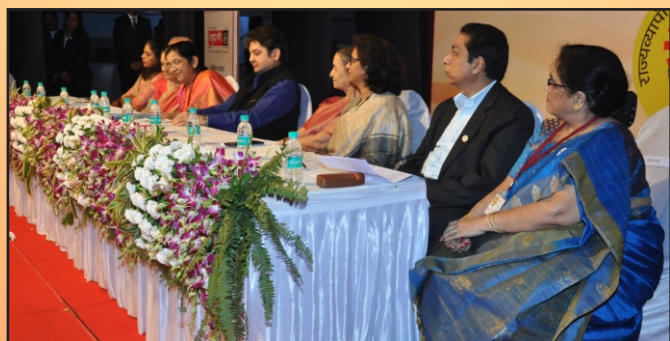
Noted dignitaries on the dais