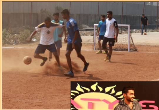
Rink football, one of the popular sports events

Pratyush 2018 is the annual inter-college cultural festival hosted by IES Management College and Research Centre. This year the event was held on 22nd and 23rd February, 2018 and saw a footfall of approximately 1000 postgraduate and undergraduate students in our campus. The college was abuzz with a lot of activity, zeal and enthusiasm on these 2 days. Around 15 colleges of Mumbai participated in the events which were classified into Management events, Sports events and Cultural events. Lala Lajpatrai Institute of Management won the Champions Trophy with the highest points overall.