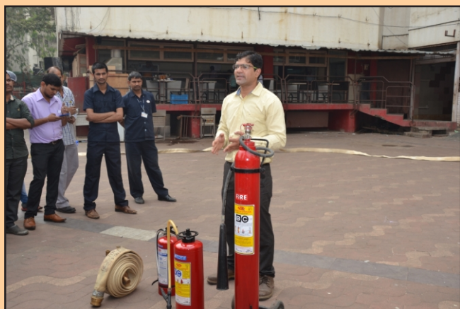
Trainer explaining the types of fire extinguishers

A faculty and staff training program on Fire Fighting and Fire Drill Training was held on Wednesday, 7th February 2018 in the premises of the Institute. Training program was very interesting and informative. The trainer explained about different types of fire and types of extinguishers to be used. Practical was done by creating small fire and many participants used these extinguishers to extinguish the fire.