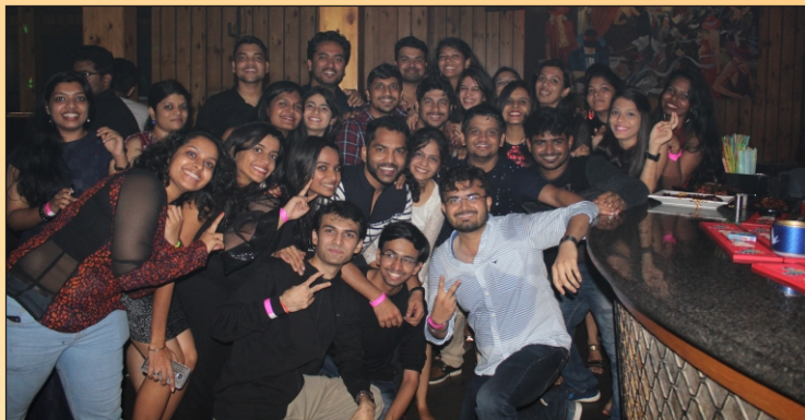
Senior batch students huddle for a memory

Batch 2016-18 danced to the scintillating music and had scrumptious food at Bora Bora, Juhu on Saturday, 17 th March, 2018 as they celebrated their farewell from the college. As mentioned by a student, the last party by IES was the most memorable one as it had a mixed bag of emotions. The senior students appreciated the DJ and the dance floor that was exclusively for IES students only.