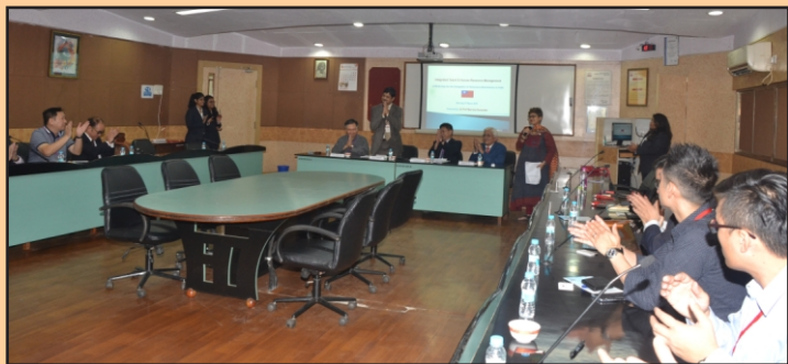
Workshop in progress