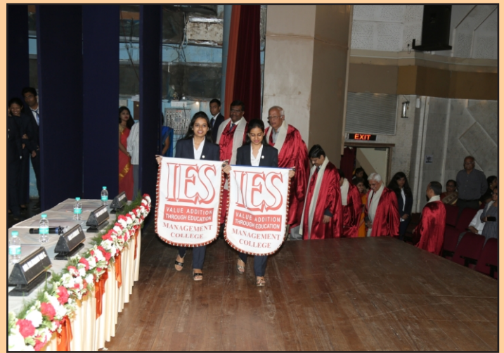
The convocation procession