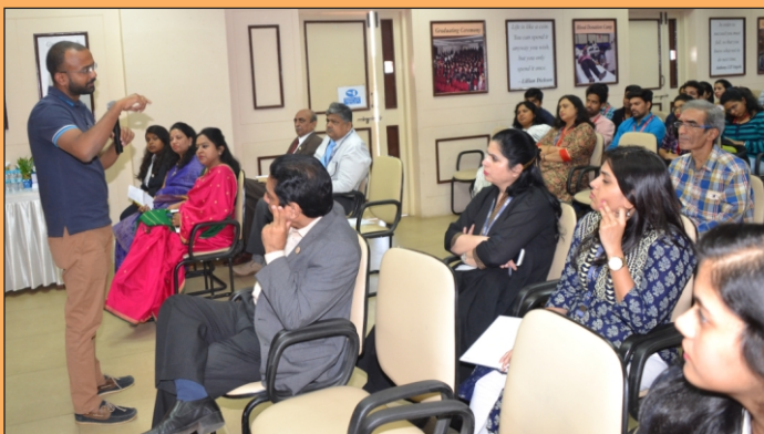
One of the panel members addressing the audience