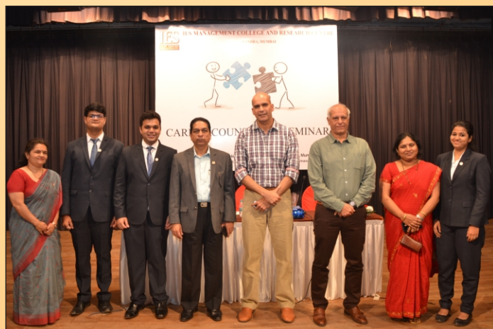
Student volunteers along with the admission team and guests