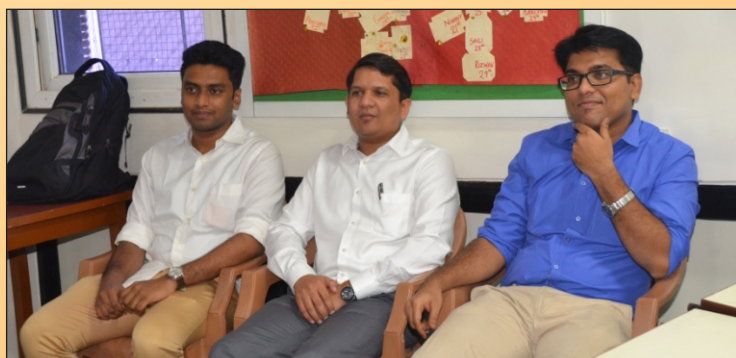
Alumni interaction with the operations specialization students