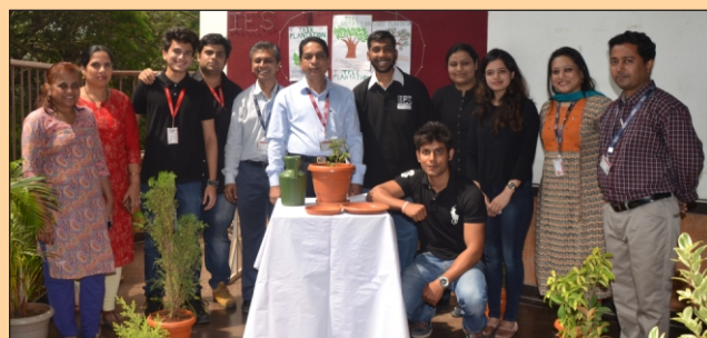
Faculty, Staff and students present for the tree plantation event