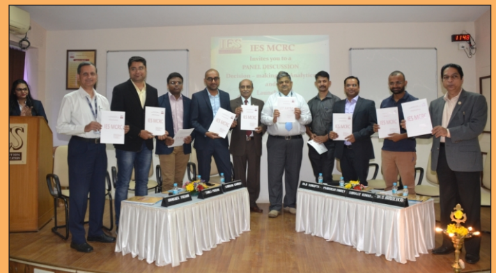
Launch of the 11 month Certificate HRM Program