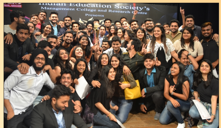
Winners of the Champions Trophy, Lala Lajpatrai Institute of Management