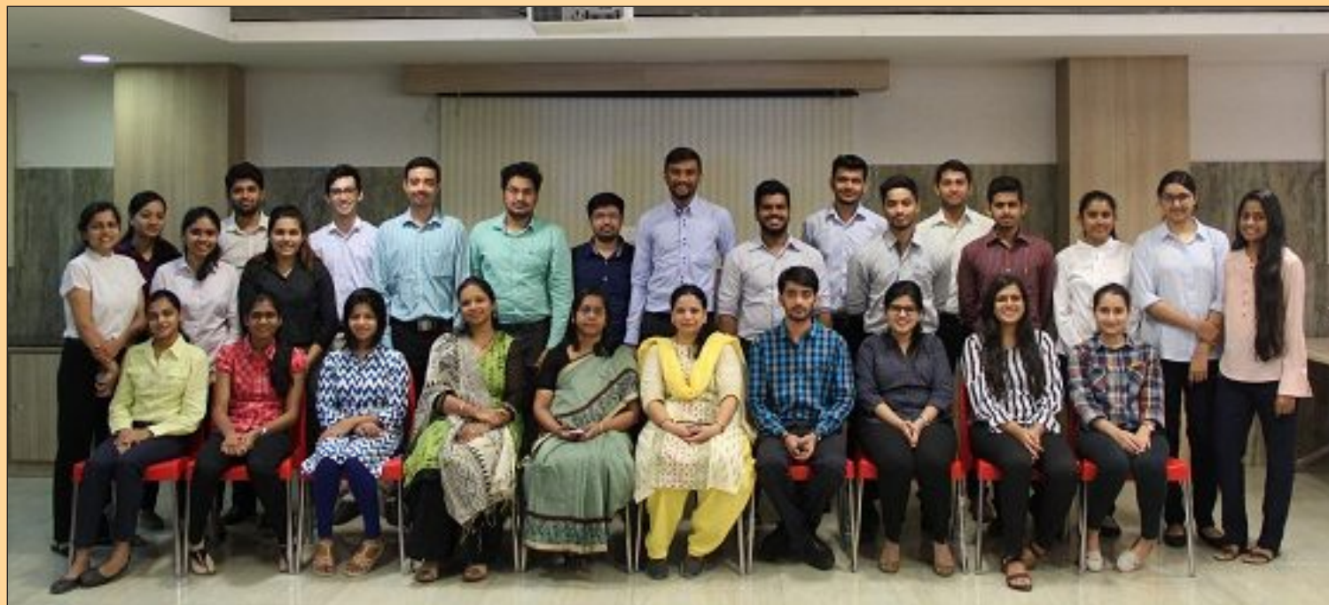
Students at NISM