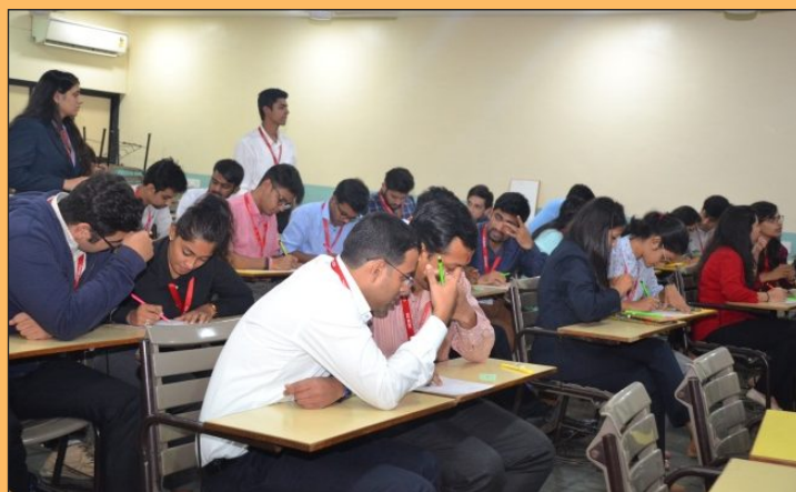
Students engrossed in making creative ads