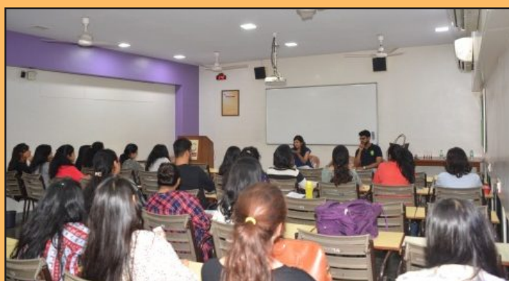
Alumni interacting with the current batch of students