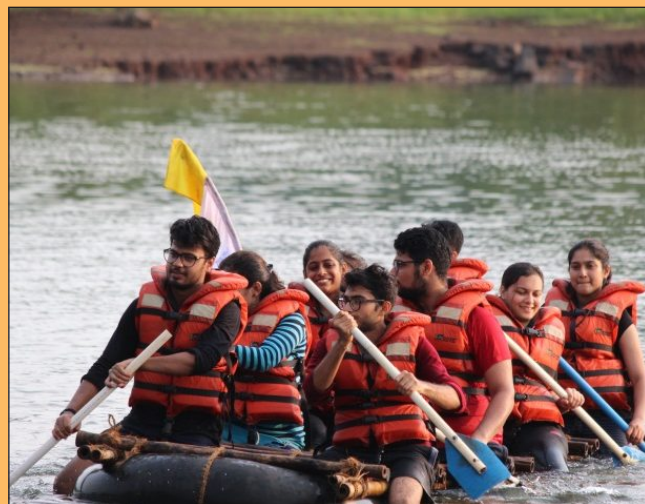
Raft building and rowing