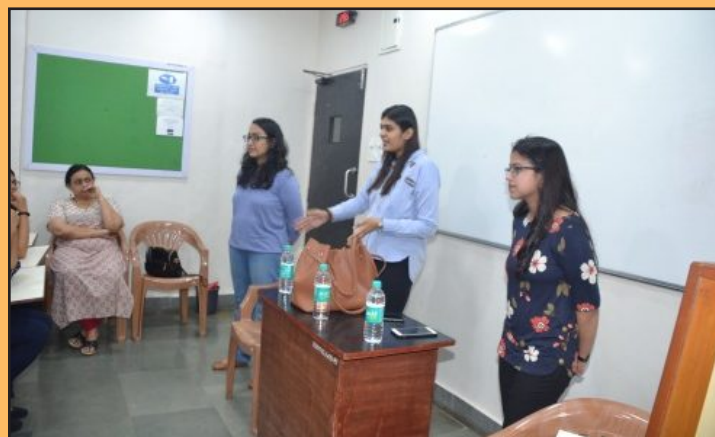
Alumni sharing their experience with the students