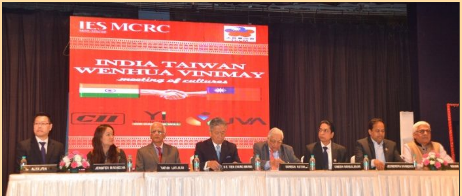
Esteemed dignitaries on the dais

Audience comprised of a variety of people. Other than IES MCRC students, there were students from other colleges like KJSMISR, Vidyalankar, Vivekanand, Vivek College and ITM. There were 31 Taiwanese including 11 Talk Management Executives from FCS, CSGT Trading, Futek Alloy Co. Ltd., Evergreen Line, T.S. Lines, Ono Teas, Asus India Pvt. Ltd., Wan Hai Lines Ltd. Top Executives from Indian Companies were also present.