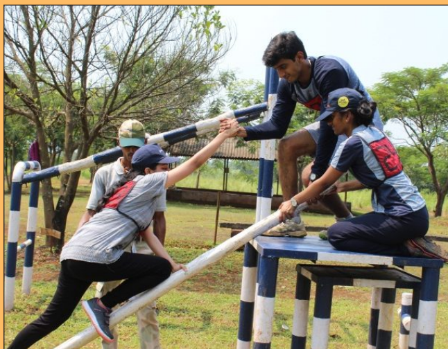
Teamwork at its best!

To enhance individual and team performance through experiential learning methodology, our students undergo an outbound training where they indulge in activities that gives them a learning-by-doing experience and brings out variety of learning outcomes focused on developing leadership and team building. This is done by Empower Activity Camp which is set amidst the scenic beauty of huge mountains and river. This training programme benefits the students tremendously as they perform activities as a team which helps them develop lasting bonds with their fellow batchmates. This year this training was conducted in two batches, Batch I comprising of PGDM students (31 st September to 3 rd October, 2018) and Batch II comprising of PGDM (PHM) and MMS students (3 rd to 6 th October, 2018).