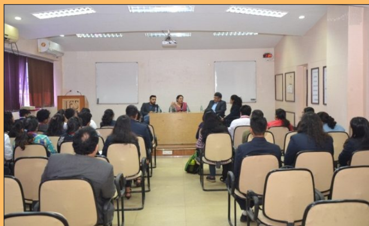
Students listening attentively to the panel members