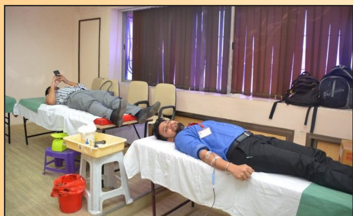
Blood donation drive