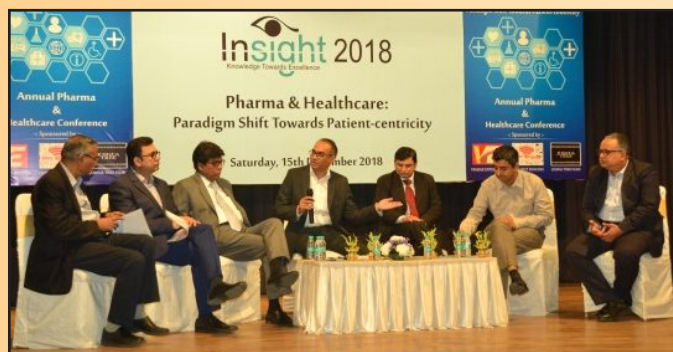
Panel discussion on Patient First - A Golden Period Ahead!