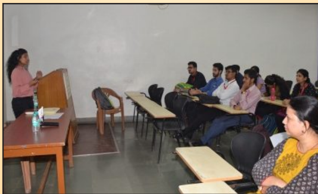
Ms. Krutika explaining students different investment avenues