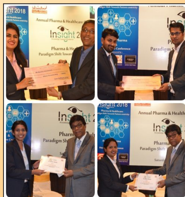
Winning students receiving the much deserved awards