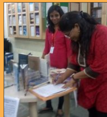
Students going through books by Dr. APJ Abdul Kalam

In order to enhance the awareness about reading, Information Resource Centre celebrated 'National Library Week' with the theme "Read to Lead". Biographies/Autobiographies were displayed on 16 th and 17 th November, 2018.