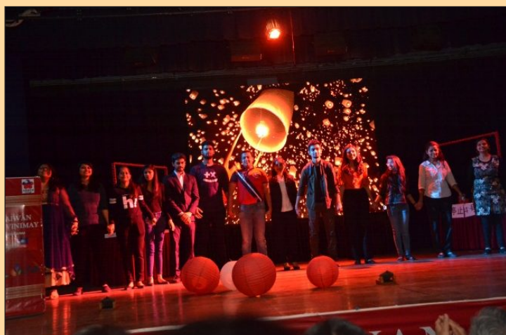
Students of IES MCRC who performed the skit in Chinese

Audience comprised of a variety of people. Other than IES MCRC students, there were students from other colleges like KJSMISR, Vidyalankar, Vivekanand, Vivek College and ITM. There were 31 Taiwanese including 11 Talk Management Executives from FCS, CSGT Trading, Futek Alloy Co. Ltd., Evergreen Line, T.S. Lines, Ono Teas, Asus India Pvt. Ltd., Wan Hai Lines Ltd. Top Executives from Indian Companies were also present.