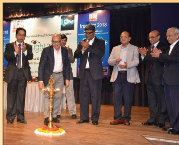
Inaugural function of Insight 2018