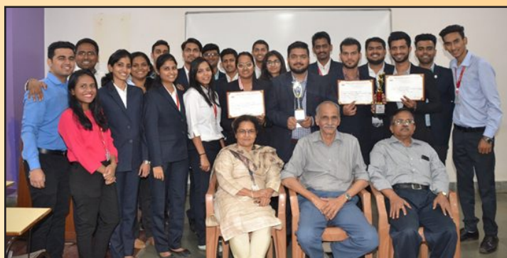
Winners and other participants of the Case Study Competition

Training @ IES : We prepare... You perform