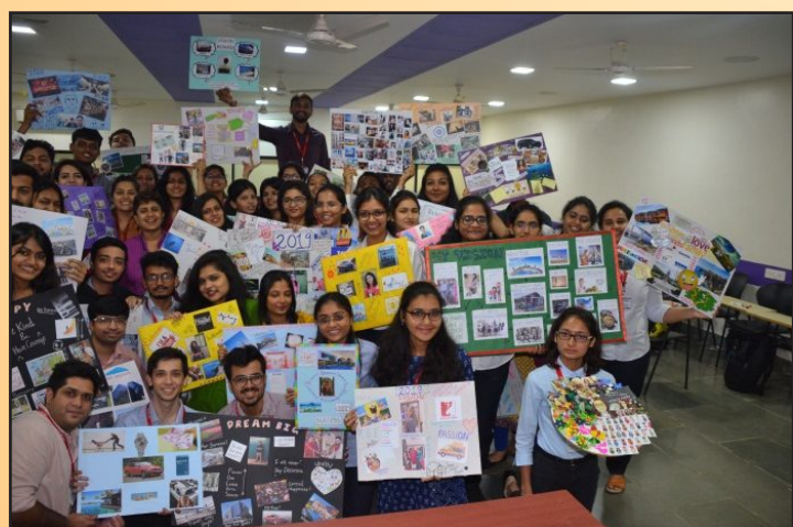
Students with their vision boards