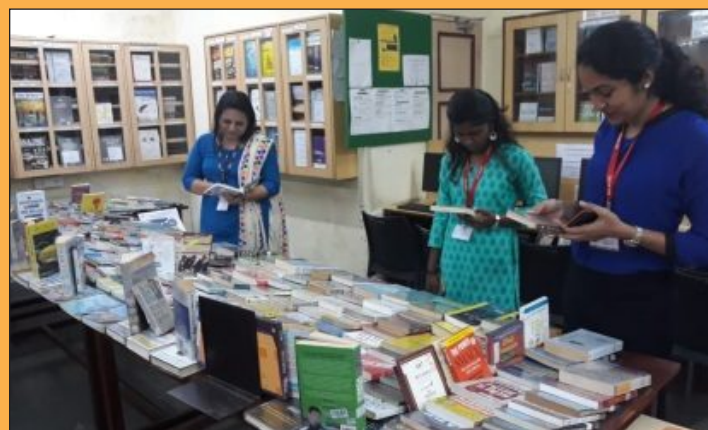
Exhibition of books on World Mental Health Day

World Mental Health Day is observed on 10th October every year. Information Resource Centre organized an in-house exhibit on the occasion of World Mental Health Day. Books on Psychology, Positivity, Stress Management, Emotions, Emotional Intelligence, Self-help, Personality Development and work-life balance were displayed in the library on 10 th and 11 th October, 2018.