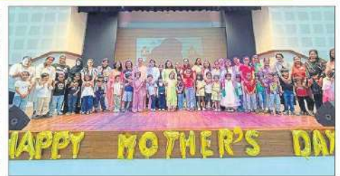
The event was organized to honour and appreciate the love, care, and sacrifices of mothers.

All the mothers enthusiastically joined the activities and enjoyed