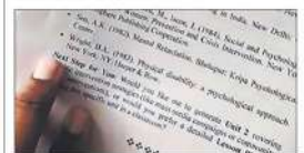
A video showing sentences in a psychology study book that appeared to have been copied directly from ChatGPT went viral.