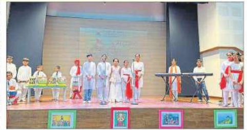
The celebration instilled a deep sense of pride and cultural awareness among students.

The Marathi teacher of the school explained the significance of the Marathi language, festivals, food and historical landmarks of the state. The principal addressed the gathering and encouraged students to respect and preserve the cultural values and