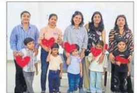
cluded with a vote of thanks and a group photograph session. The event was a grand success and left everyone with beautiful memories filled with love, respect, and happiness.